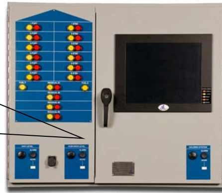
Guard Level 07324 MCU

Very compact main control panel for cargo level, temperatures, tank pressure and if supplied all other ballast and service tank levels. Main panel incorporates independent 98% level alarm (shown) Power fail alarm for both mains and auxiliary power sources are provided. SerialRS422/485 and Ethernet ports are provided as well. Complies with IMO, USCG and Class requirements for closed loading and incorporates intrinsically safe sensor inputs/outputs. Required power: Recommended 24VDC from Bergan Guard Power® UPS supply.