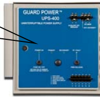
Guard Power™ UPS-400

Features 6 individual circuits and have built-in power fail alarm and relay output. Fan-less quiet design. Suitable for bulkhead mounting and additional displays can be supplied for bridge and ECR.