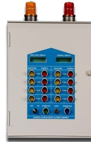
Guard Level Deck Alarm Cabinet with solar panel